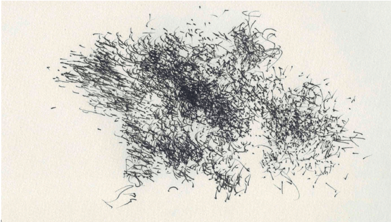
Collette Egan, Walking Drawings Series